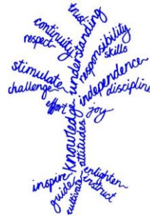
Hinchley Wood Primary