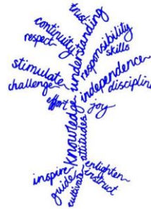
Hinchley Wood Primary